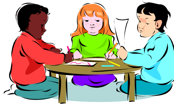
Safe and secure home setting

Intensive individual support services involve intensive one-on-one interventions to assist in the care, treatment, and habilitation of clients. Services are provided in the clients' home or in the community. Intensive individual support workers in addition to assisting in and/or providing activities of daily living also serve as instructional technician, therapeutic aide, bus aide, or interpreter.